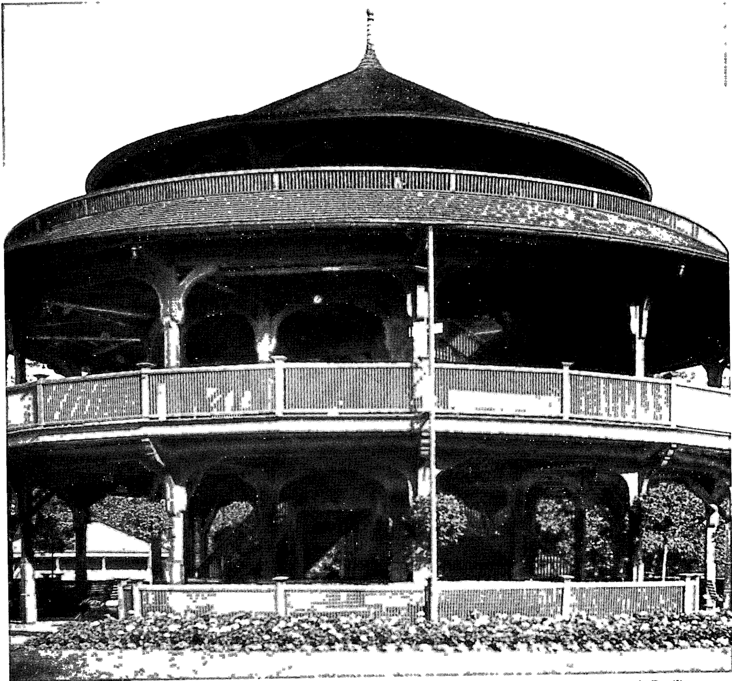
Built in 1890 and dedicated to the children of Rochester in the first park ceremony, this three-story open air Children's Pavilion was a popular gathering place. Its location on the summit of a hill by the Highland Reservoir provided a beautiful view of the surrounding countryside. Bands often performed on the second floor. The building was torn down in the 1960's because of disrepair.