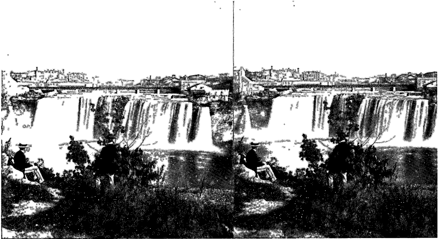
View near Falls Field, an early fairgrounds and picnic site now known as Upper Falls Park. This stereopticon view from the collection at the International Museum of Photography at George Eastman House shows several mills in the distance and the elevated railroad bridge.